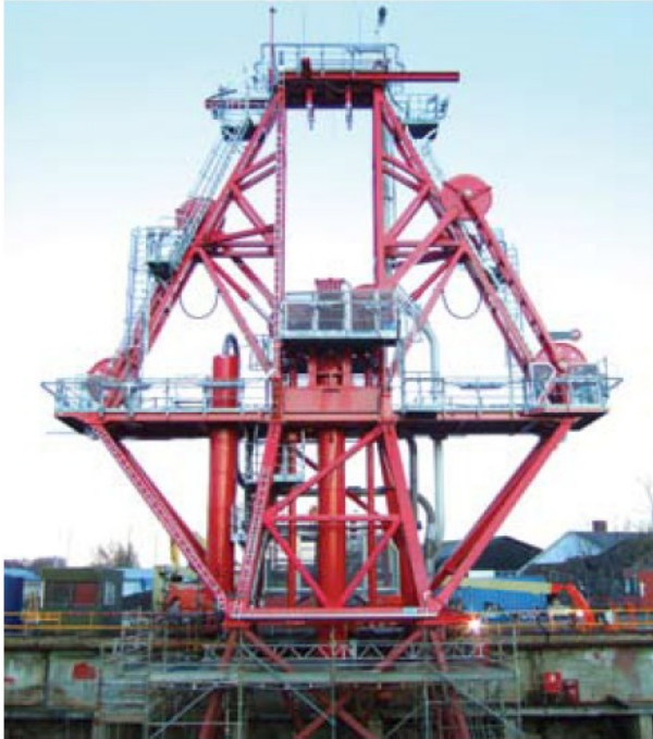
Figure 1: Drill string compensator (20m tall)

University of Agder and Aker Solutions, Norway